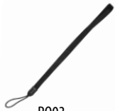
R003 Nylon Hand Strap