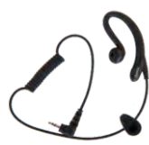
EHS18 ① Receive-Only C-style Earpiece