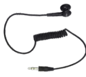
ES-01 Receive-Only Earbud