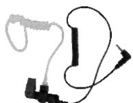
EAS03 ① Receive-Only Transparent Acoustic Tube Earpiece