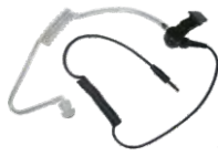
ES-02 Receive-Only Transparent Acoustic Tube