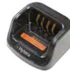
CH10L27 Drop-In Single Unit Charger