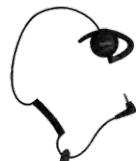
EHS17 ① Receive-Only Adjustable Earhook with Swivel Speaker