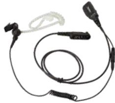
EAN24 Transparent Acoustic Tube Surveillance Earpiece with microphone and in-line PTT button