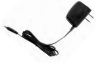
PS1014 Power Adapter