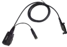
ACN-02 Mic and PTT button with VOX and 3.5mm Jack Receive-only Earpiece (IP54)

External earpieces that are used in combination with the ACN-02