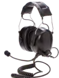
ECN21 Heavy-duty noise-cancelling headset with PTT and boom microphone