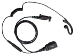
EHN26 C-style Earpiece with microphone and in-line PTT button

External earpieces and microphones that attach directly to the radio