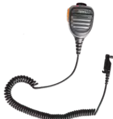
SM26N2 ① Palm PTT Mic with Speaker and emergency button (IP54)