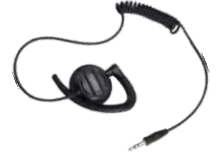
EH-02 Receive-Only Swivel Earpiece