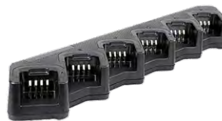
MCL32 6-Radio Multi-Unit Charger