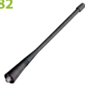
Ships with Standard Long Antenna