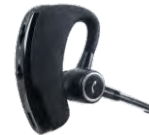
ESW08 Bluetooth Earpiece with PTT button and microphone