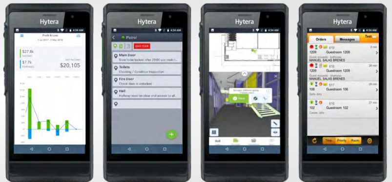
Screenshots shown are trademarks of their respective companies.