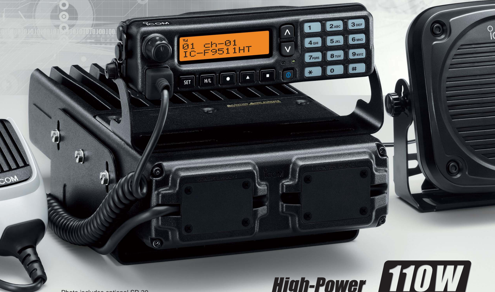
Photo includes optional SP-30.