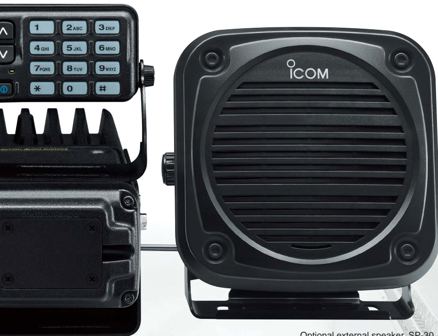
Optional external speaker, SP-30