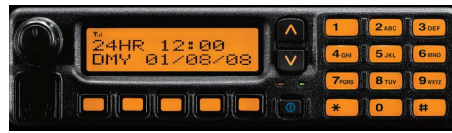
Internal clock setting example

With a high contrast dot matrix display, upper and lower case characters can be easily distinguished. The display shows 12 characters by 2 lines. LCD backlight is standard.