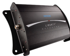
Repeaters for Extended Range