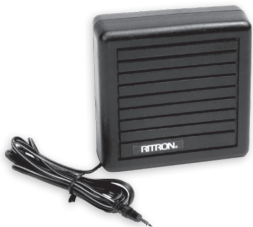
RSP-5 External Speaker