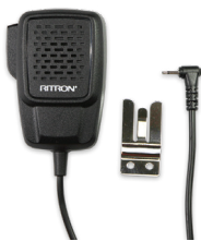
RM-7 Hand Mic